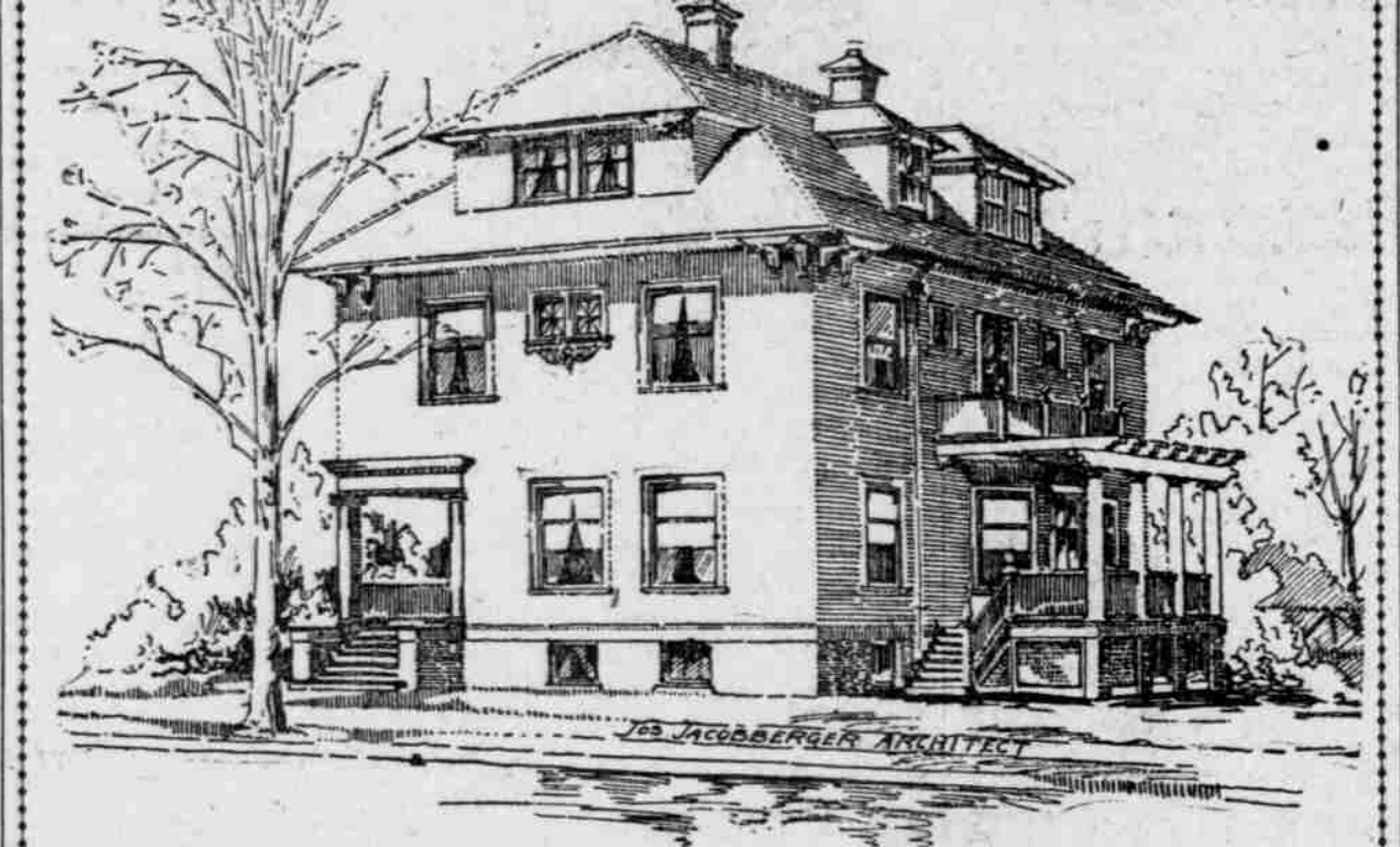
THE ACCOMPANYING CUT REPRESENTS THE PERSPECTIVE OF THE RESIDENCE OF RICHARD R. HOGE, NOW BEING BUILT ON THE NORTHWEST CORNER OF TWENTY-SECOND AND EVERETT STREETS.

looking after the proposed livestock show at the Lewis and Clark Fair in 1905; suggesting any changes in the preliminary list of livestock to State Fair; to encourage a big livestock show in Portland in 1904, and such other matters as may be brought before the meeting.