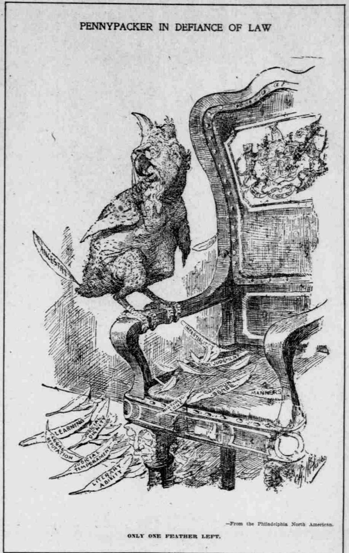
PENNYPACKER IN DEFIANCE OF LAW