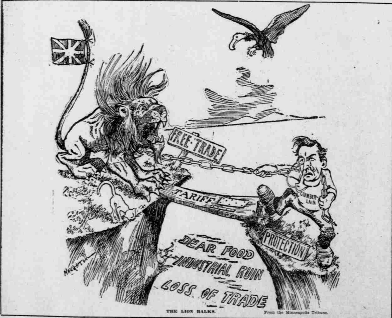
THE LION BALKS.