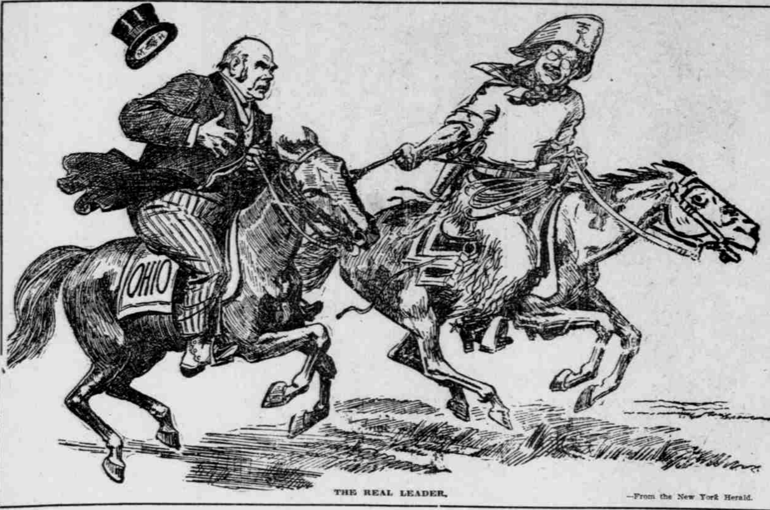
THE REAL LEADER.