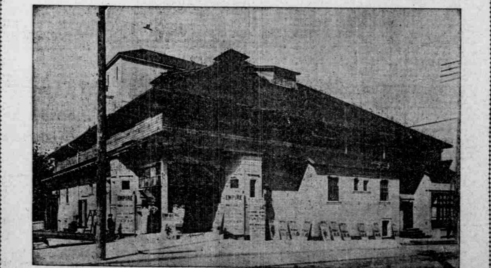
THE EMPIRE THEATER, TWELFTH AND MORRISON STREETS.

THIS OFFER IS A WONDER, BUT WE MEAN BUSINESS.