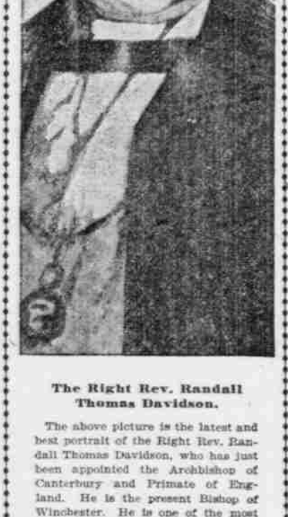
The Right Rev. Randall Thomas Davidson.

The above picture is the latest and best portrait of the Right Rev. Randall Thomas Davidson, who has just been appointed the Archbishop of Canterbury and Primate of England.