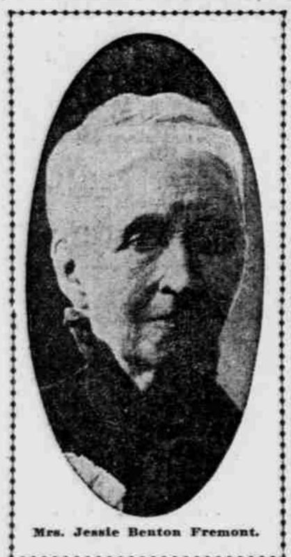
Mrs. Jessie Benton Fremont.

For the past three years the aged widow of the "Pathfinder" had been extremely feeble, as a result of a fall in which she suffered dislocation of the hip, which has since prevented her from walking.