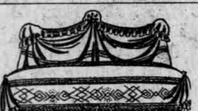
Couches, Cozy Corners and Draperies made to order. Designs and estimates furnished. We can make up a Couch, style as above, as cheap $12.50

Tables, Chairs and Rockers in antique shapes at reasonable prices.