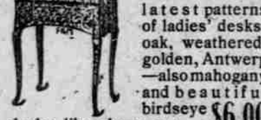
Here also you can find the largest number and the latest patterns of ladies' desks, oak, weathered, golden, Antwerp—also mahogany and beautiful birdseye $6.00