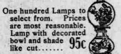
One hundred Lamps to select from. Prices are most reasonable. Lamp with decorated bowl and shade like cut... 95c