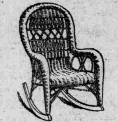
Fine large comfort rocker, shellac finish, regular price $5.50. We make special this week... $3.85

Practical people appreciate practical gifts, and nothing fills the bill so completely as a rug or some article of furniture for the home. The stream of regular customers who are buying here daily is a source of great satisfaction to us, but we are a progressive house, we must seek new trade—that's why we advertise. We can save you from 5 to 30 per cent. on many articles. We have our own factory, and goods are made to wear. Buy from the maker.