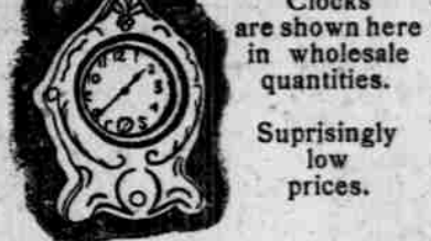
Clocks are shown here in wholesale quantities. Surprisingly low prices.

Nickel Alarm Clocks that will run... 75c Gilt Clocks, like here shown... $1.50 Eight-Day Clocks, oak case, with barometer and thermometer, strikes every half hour... $3.50