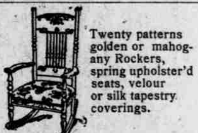
Without arms $5.00 With large arms $6.75