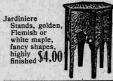
Jardiniere Stands, golden, Flemish or white maple, fancy shapes, highly finished $4.00