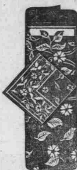
Table and Household Linens

Every housekeeper knows good linens when she sees them; every woman delights in a beautiful, glossy supply of it for her table, and rejoices in a bountiful store for the household. Our linen bargains this week afford excellent opportunity to secure extra good values at greatly reduced prices.