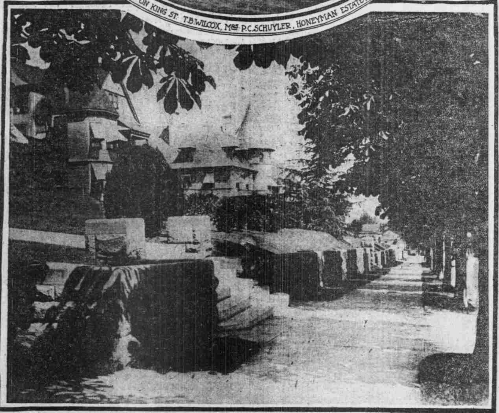
BLOCK ON KING ST. BETWEEN PARK AVE. & WAYNE ST. LOOKING NORTH.