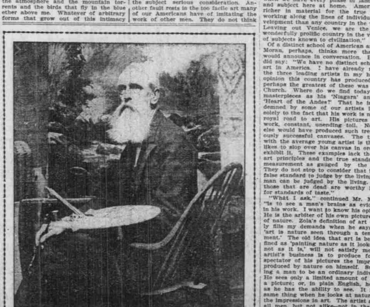
THOMAS MORAN, PAINTER.