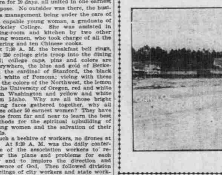
VIEW OF THE BEACH AT CAPITOLA.