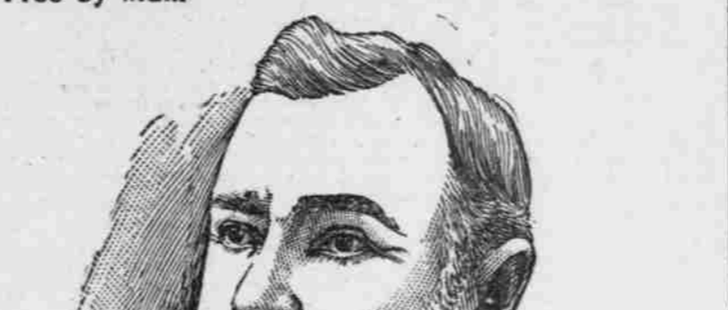
East Atlanta, Ga., March 1, 1901.