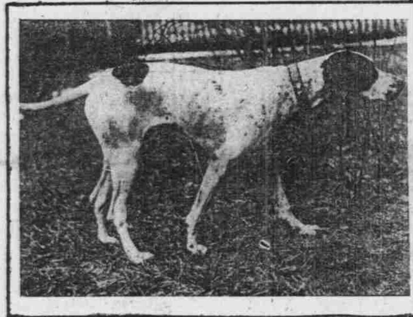
Oregon's Jessie II