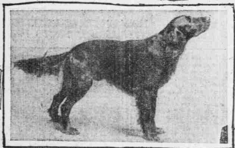
Champ Count Mack