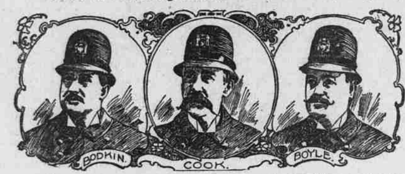
65TH POLICE PRECINCT, GREATER NEW YORK, Oct. 11, 1900.

Reporters Have Convincing Interviews With Prominent People Regarding Wonderful Cures by SWAMP-ROOT.