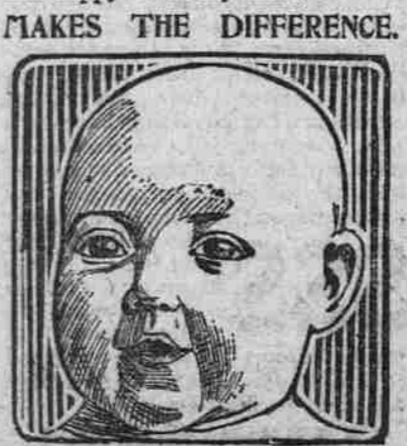
MAKES THE DIFFERENCE.