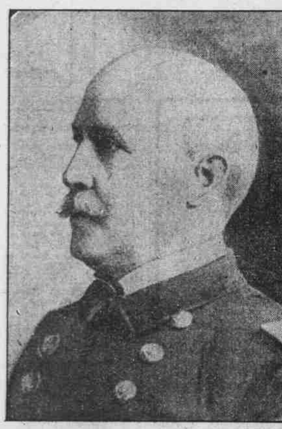
THE COMMANDER OF THE CRUISER NEW YORK DURING THE WAR WITH SPAIN WAS THE PRINCIPAL WITNESS BEFORE THE SCHLEY NAVAL COURT YESTERDAY.