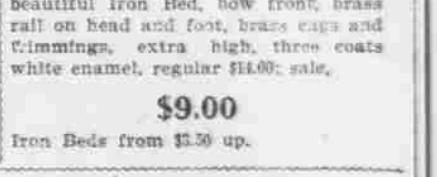
Iron Beds from $3.50 up. $9.00