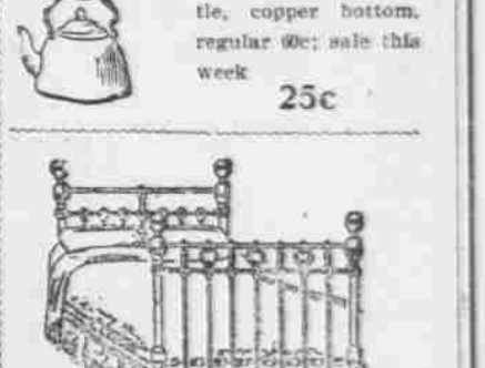
No. 8 Tin Tea Kettle, copper bottom, regular $60; sale this week 25c