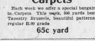
Carpets. Each week we offer a special bargain in Carpets. This week, 500 yards best Tapestry Brussels, beautiful patterns, regular $1.00 grade, 65c yard.