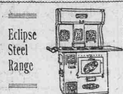
Six-hole No. 5 Eclipse Steel Range and high closet. $27.50

Over one hundred styles of Eclipse Steel Ranges and Heaters. Each Range warranted absolutely a perfect baker, and not to crack in fifteen years. Buy the best at the price of the cheapest.