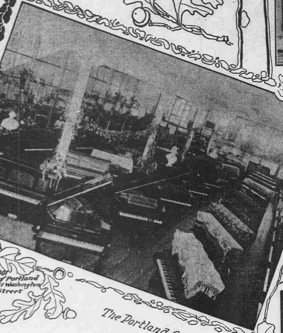
EILERS PIANO HOUSE 1901 Interior View of Portland Salesroom 351 Washington Street