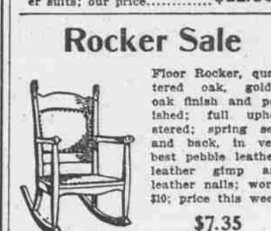
Floor Rocker, quartered oak, golden oak finish and polished; full upholstered; spring seat and back; in very best pebble leather; leather gimp and leather nails; worth $10; price this week, $7.35

FOR OPEN COMPETITION PORTLAND CONCERN ASKS THAT BIDS ALWAYS BE INVITED.