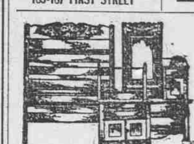
This very neat cheval ash Bed-room Suit. $16.00