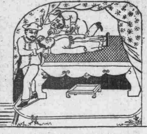
Missionaries Represented as gouging out the eyes of a Chinese Convert.