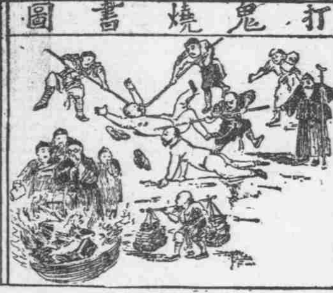
"The beating of the foreign devils and the burning of the Christian Books."