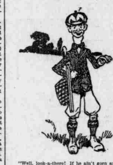
"Well, look-a-there! If he ain't gone and retrieved 'is own bloomin' tail!"

Harry Edgehope—I've it outthink behind them there stones; I dunno whether it's a rabbit or what—where's that bloomin' retriever? Hill fetch it in, good dog!