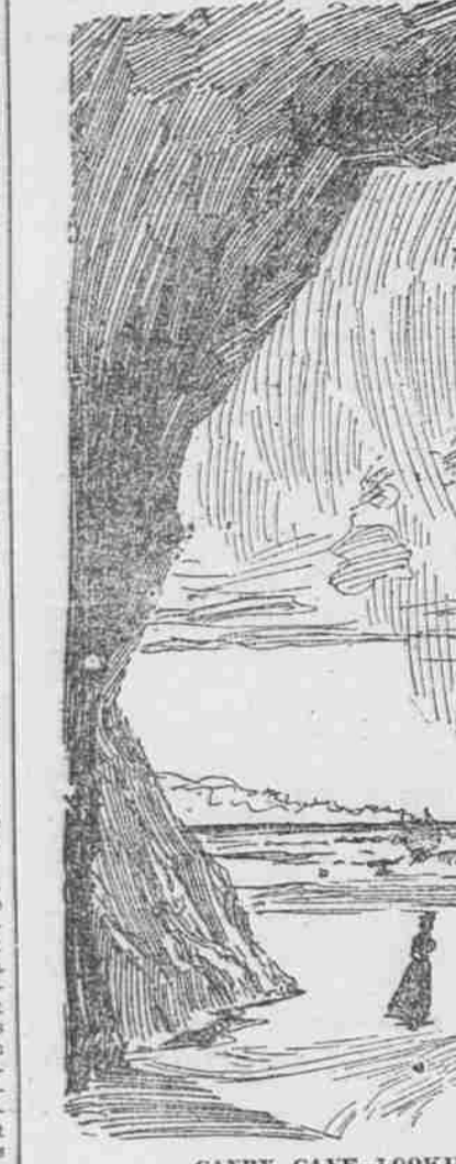
CANBY CAVE-LOOKING FROM CAVE TO BEACH.