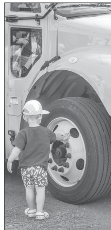
A child touching a schoolbus at the 2024 Touch-A-Truck Event.

Children can visit the safety stations and enjoy a variety of vehicles on display. Each family will leave with supplies and education to ensure children stay safe.