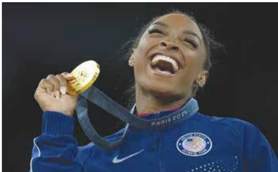
Simone Biles, of the United States, celebrates after winning the gold medal at the medal ceremony during the women's artistic gymnastics individual vault finals at Bercy Arena at the 2024 Summer Olympics, Saturday, Aug. 3, 2024, in Paris, France.

Her sequined red leotard a blur in the air, Biles averaged 15.300 on her two vaults to