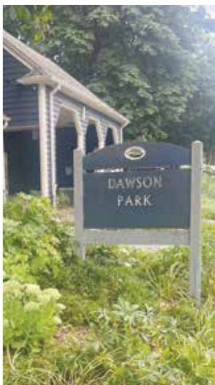
Dawson Park, Two people were injured in a shooting at a North Portland park.

On Friday, July 19, 2024, at approximately 4:05 p.m., officers responded to reports of a shooting at Dawson Park in North Portland. When officers arrived, they located one gunshot victim who was subsequently transported to the hospital. An additional gunshot victim went to the hospital on their own. Both are expected to survive. The suspect(s) had fled the scene before officers arrived.