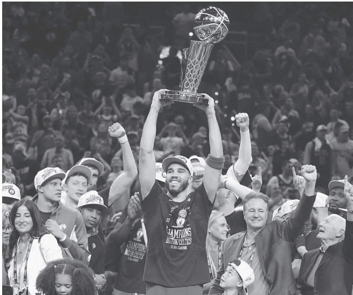
Boston Celtics forward Jayson Tatum hold, center, up the Larry O'Brien Championship Trophy as he celebrates with the team after they won the NBA basketball championship with a Game 5 victory over the Dallas Mavericks, Monday, June 17, 2024, in Boston.