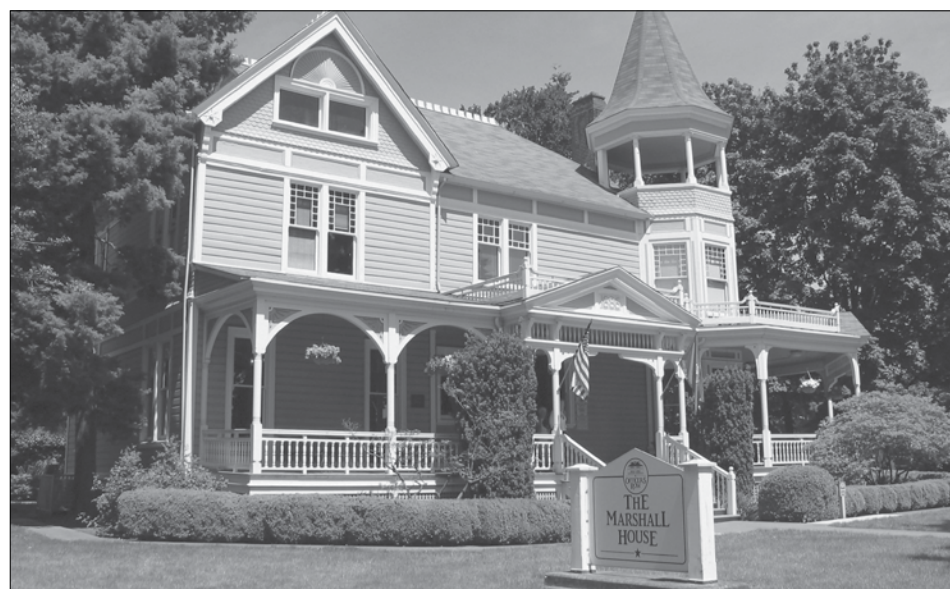
The Marshall House