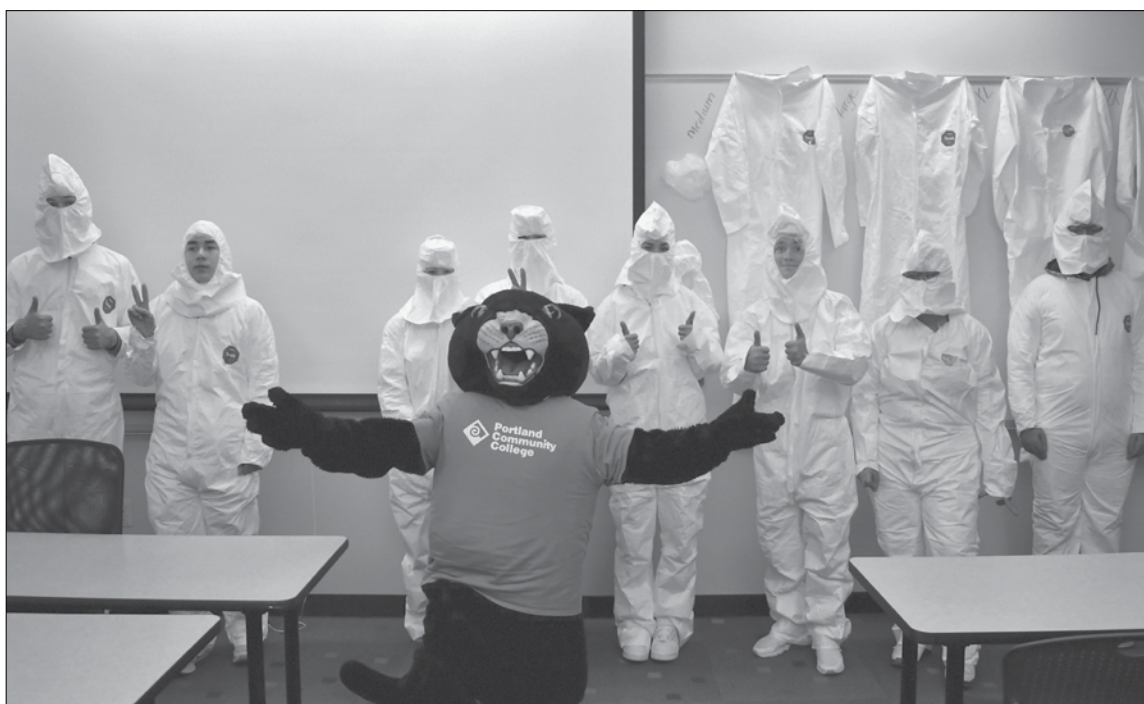
Practicing gowning with Poppie the Panther