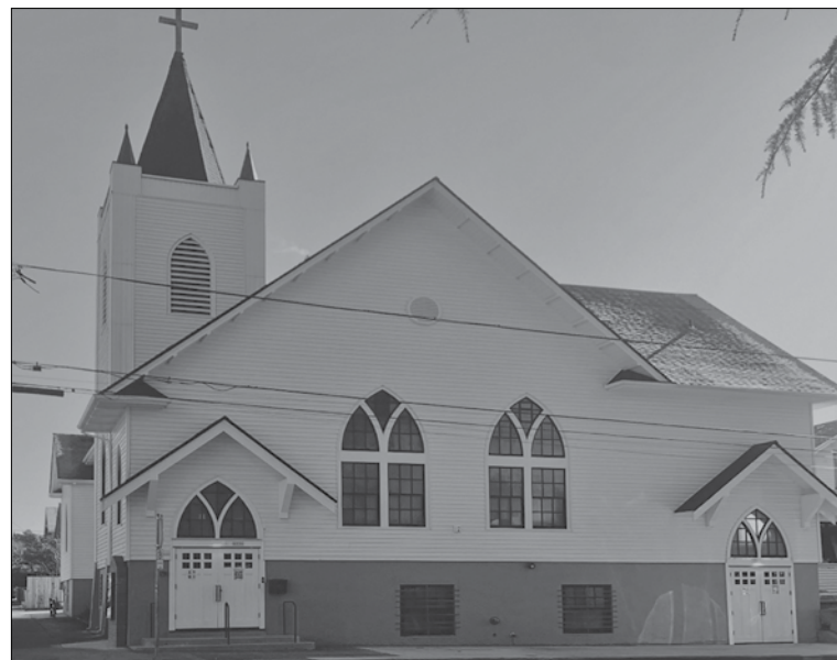
Allen temple church. New daycare will be held at the church

We have created a loving, nurturing, safe and stimulating environment for all children. We are in compliance with all the guidelines and rules according to the Oregon Department of Human Services/ Oregon Department of Education Early Learning Division Office of