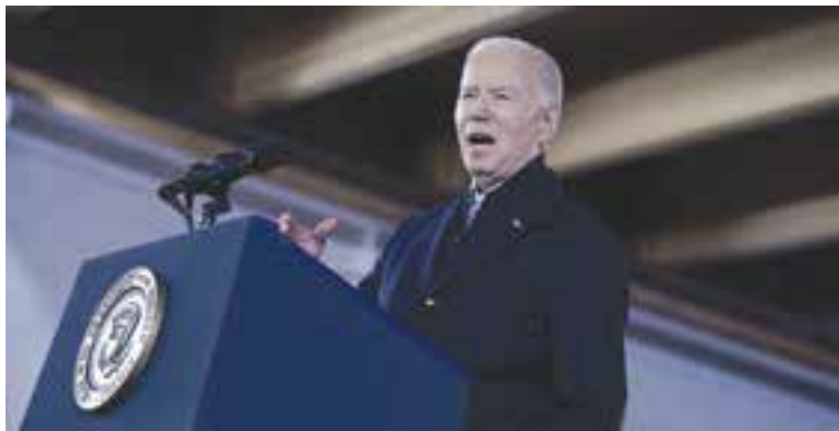
President Joe Biden

Much of the money would fund the making of microcontrollers, which are used by the military as well as in autos, household appliances and medical devices. Government officials said they expect-