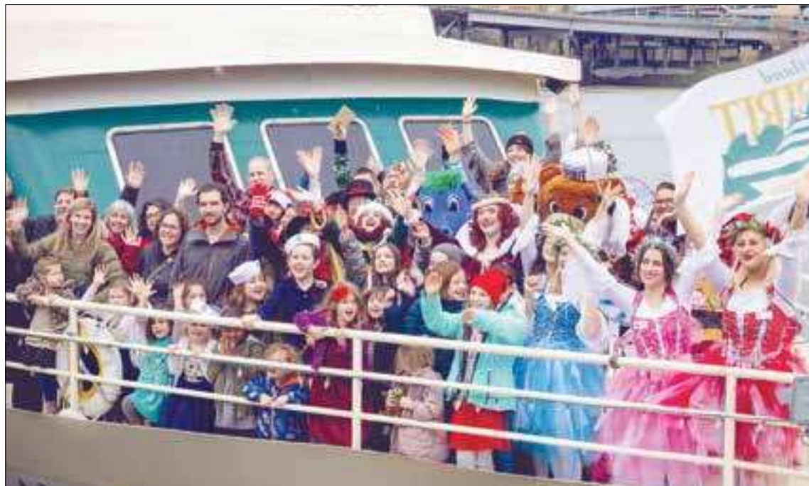
Cast of Cinnamon Bear on Bow.