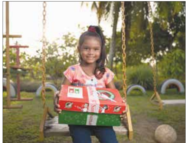
Portland Residents Collect School Supplies for Children Overseas!