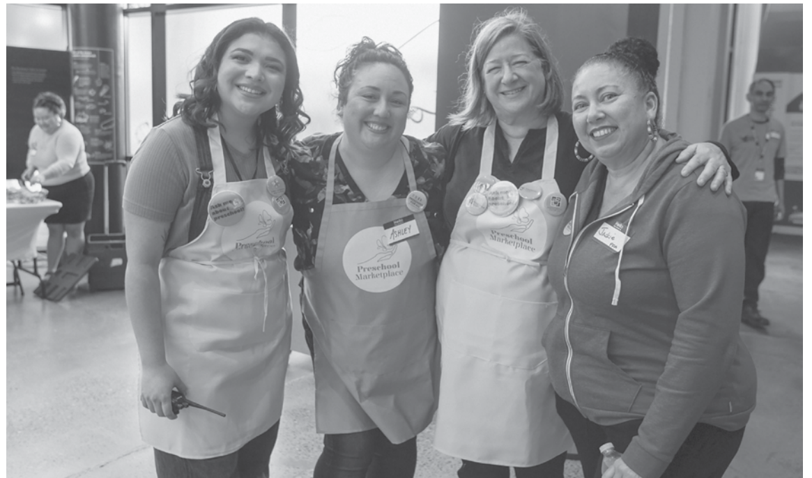
United Way launched Preschool Marketplace at a free event recently held at OMSI.