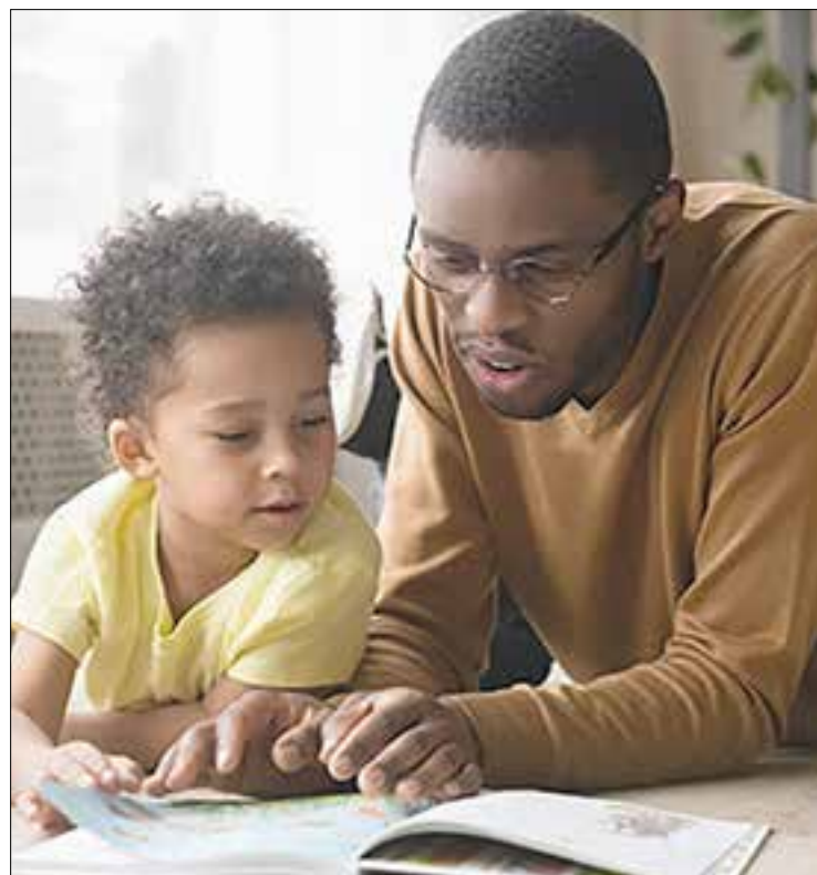
Parents reading with their children greatly support their literacy growth.

A parent’s understanding of each element at play in their