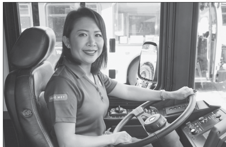
March 18th is now Transit Driver Appreciation Day.

They help move millions, yet welcome one at a time, for a safe, reliable ride. Although Transit Driver Appreciation Day traditionally falls on March 18, TriMet has moved our celebration up one day last Friday, to bring it into the traditional work week, when