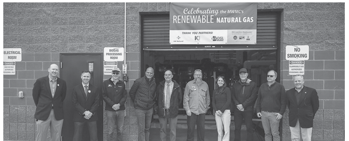
Renewable Natural Gas Team