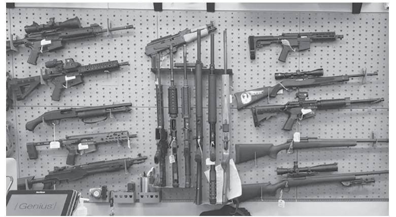
Firearms are displayed at a gun shop in Salem, Oregon, last year.

Measure 114 expands background checks, requires gun owners to take a training course for a permit before they can even buy a gun, ban magazine clips that have more than 10 rounds, and registers all gun owners in a database run by Oregon State Police. The biggest legal flash point is a ban on magazines over 10 rounds unless they are owned by law enforcement or a military