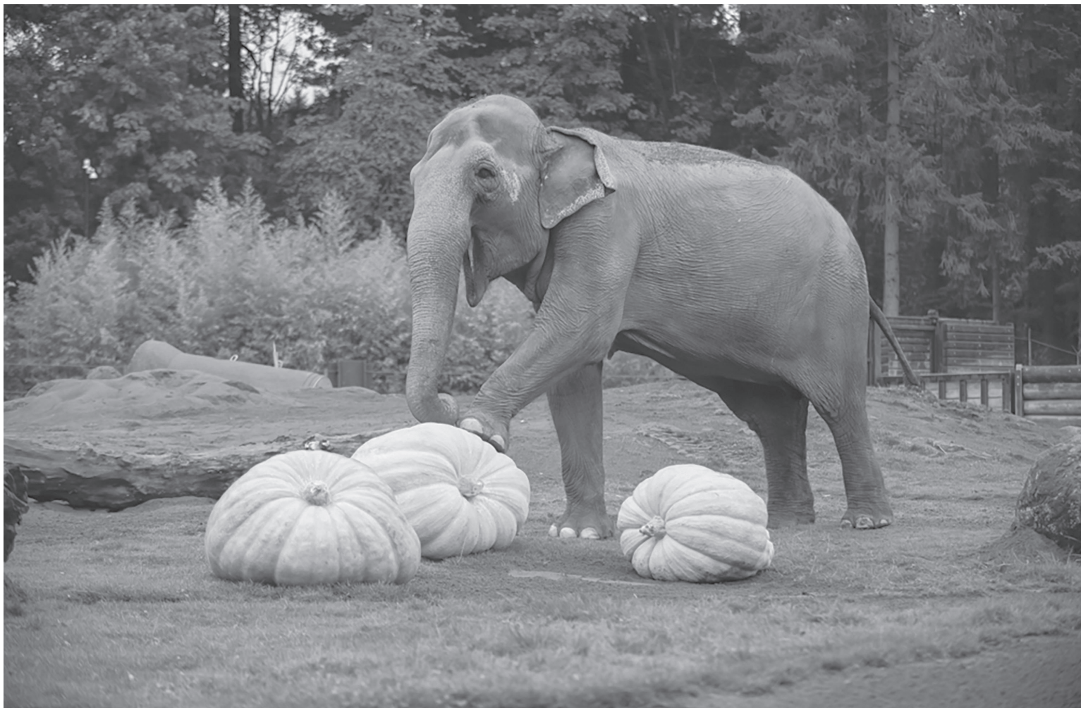
The Oregon Zoo's Asian elephant family destroys and enjoys some giant pumpkins during last year's Squishing of the Squash.

Asian elephant family takes enjoys pumpkin season leading up to Zoo's annual celebration