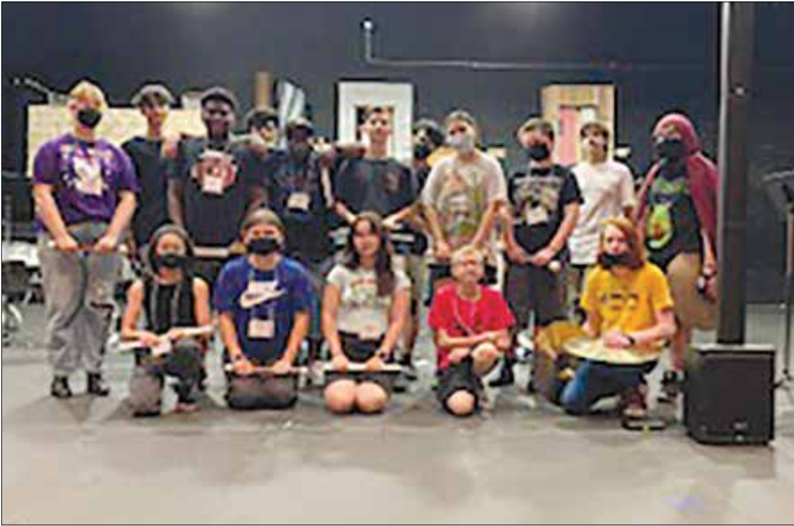
The Parkrose Drumline