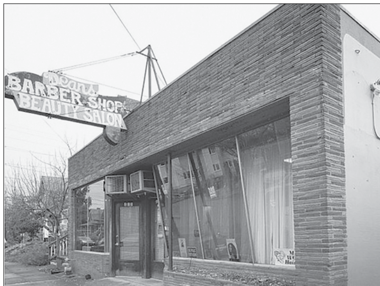
Dean's Barber and Beauty shop is Oregon's oldest African American salon - in business since 1956!