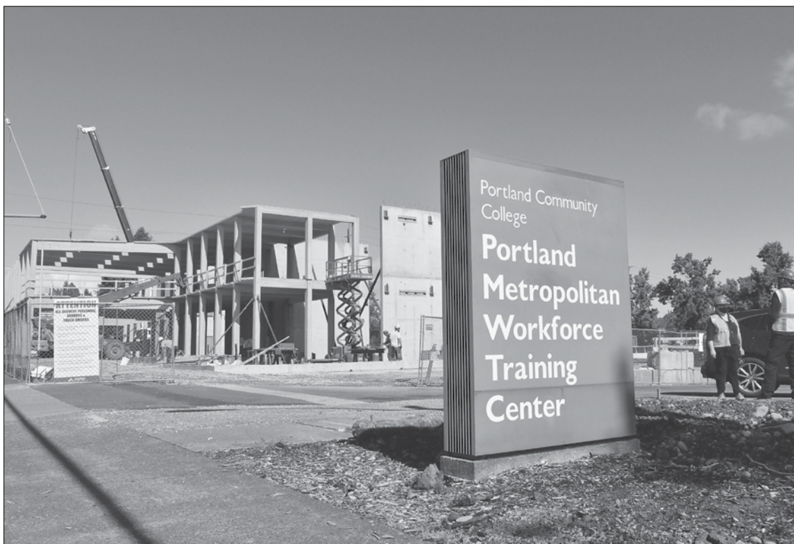
Construction rises along Northeast Killingsworth Street at 42nd Avenue where Portland Community College is partnering with Home Forward to develop and manage affordable housing.