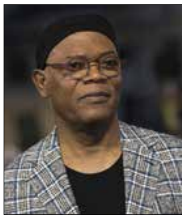
Samuel L. Jackson

Actor Samuel L. Jackson will receive the Chairman's Award during the 53rd NAACP Image Awards Saturday.