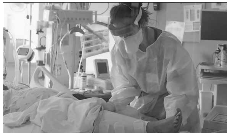
A nurse cares for a critically ill patient in the Intensive Care Unit at Oregon Health and Science University. The number of people hospitalized with COVID-19 increased to 692 statewide this week, but hospitalizations were still about 40% below their peak during a summer surge.

The Parkrose School District said temporary distance learn-