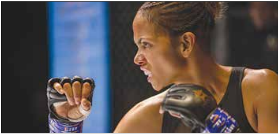
Halle Berry is on the comeback trail as a mixed martial arts fighter and protective mother in "Bruised," a movie that she also makes her debut as the film's director.