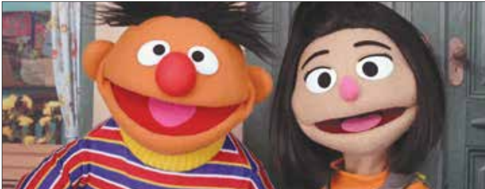
Ernie, a muppet from the popular children's series "Sesame Street," appears with new character Ji-Young, the first Asian American muppet, on the set of the long-running children's program.

What's in a name? Well, for Ji-Young, the newest muppet resident of "Sesame Street," her name is a sign she was meant to live there.