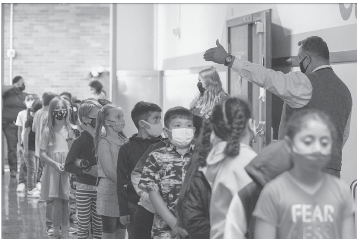
In anticipation of final approval of COVID-19 vaccines for 5 to 11 year olds, Portland Public Schools will host multiple pediatric vaccination clinics.