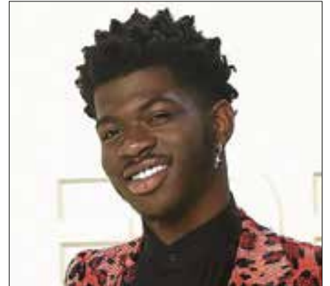
Rapper Lil Nas X

(AP) — Lil Nas X has been awarded the inaugural Suicide Prevention Advocate of the Year Award from the advocacy group The Trevor Project, a nonprofit dedicated to suicide prevention and crisis intervention for lesbian, gay, bisexual, transgender, queer and questioning young people.