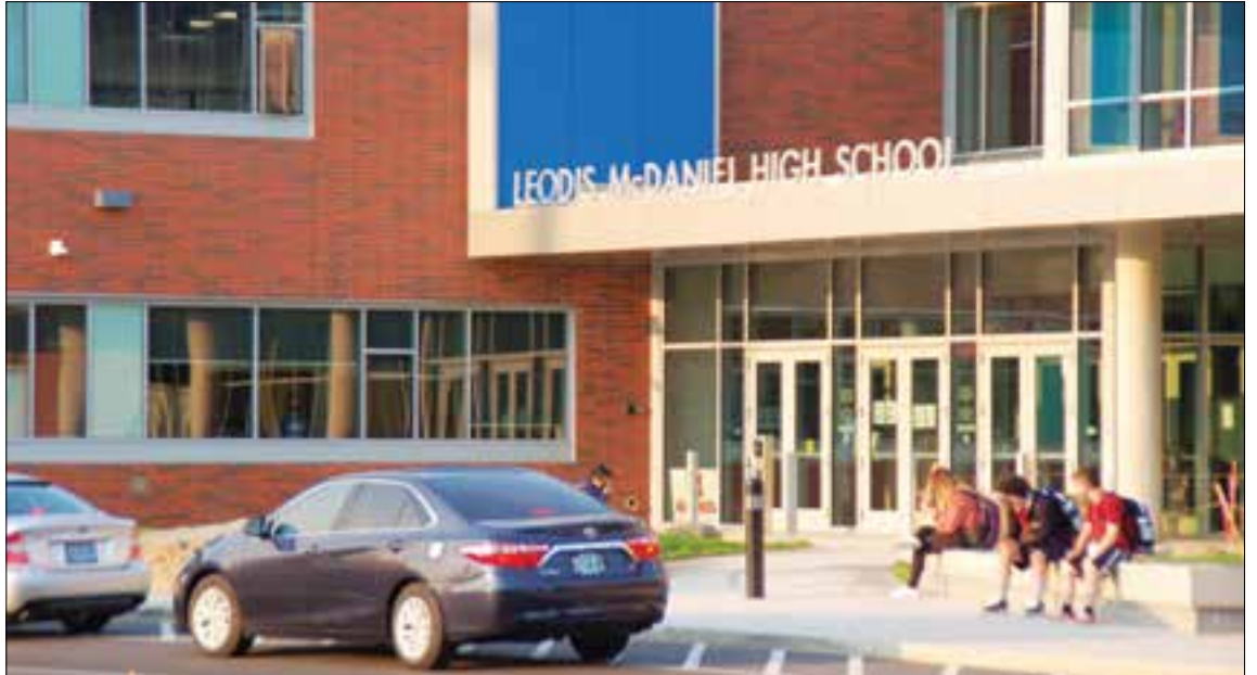
Portland Public Schools celebrates the reopening of Leodis McDaniel High School, a fully modernized 21-century learning environment for the former Madison High School campus in northeast Portland.