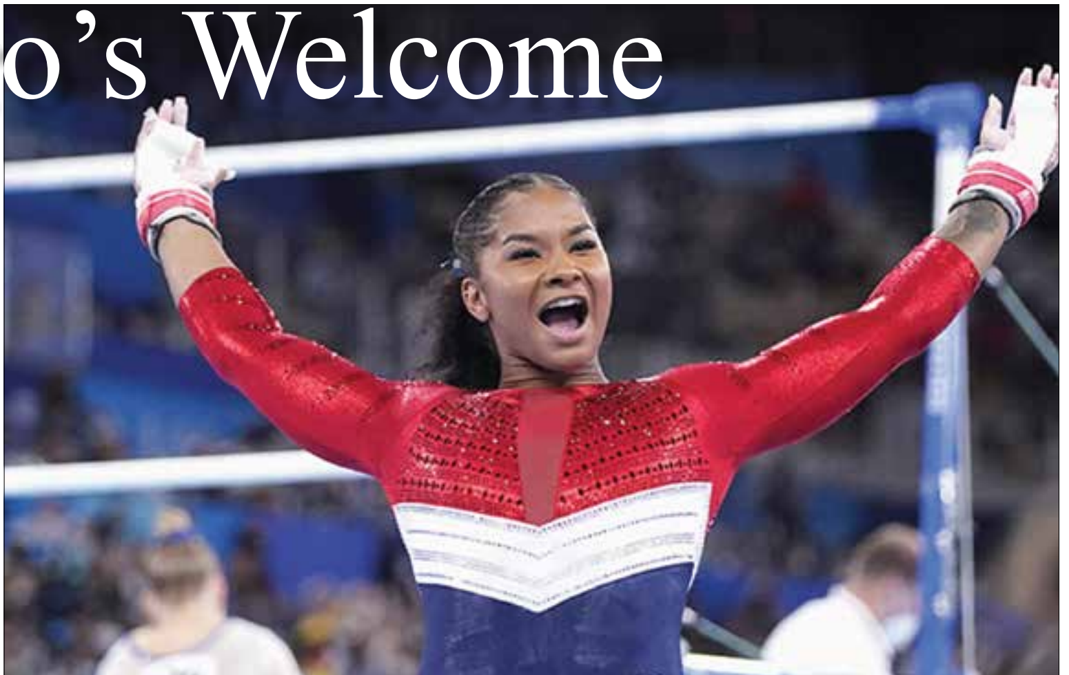
Vancouver's Jordan Chiles, a silver medalist with the U. S. gymnastics team at the Tokyo Olympics, will be given a parade in her honor and a key to the city on Sunday, Aug. 22, starting at 1 p.m. from the Vancouver Dairy Queen in Uptown Village, and then proceeding downtown.

The parade will start at the Dairy Queen in Uptown Village, 2707 Main St., travel down Main to West Sixth Street, downtown, and continue west where it will stop at Vancouver City Hall. Spectators are encouraged to stand on the sidewalk along Main Street to cheer Chiles during