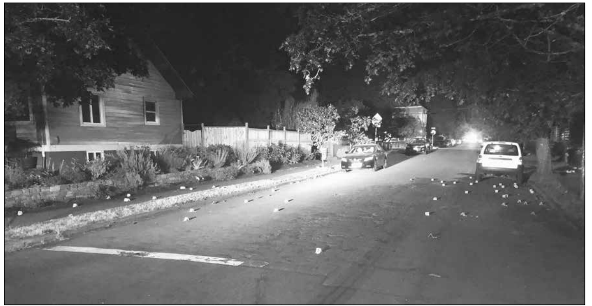
Portland Police mark where up to 80 bullets and bullet fragments landed during a Saturday night shooting on Northeast Seventh and Wygant Street, near King Elementary School.