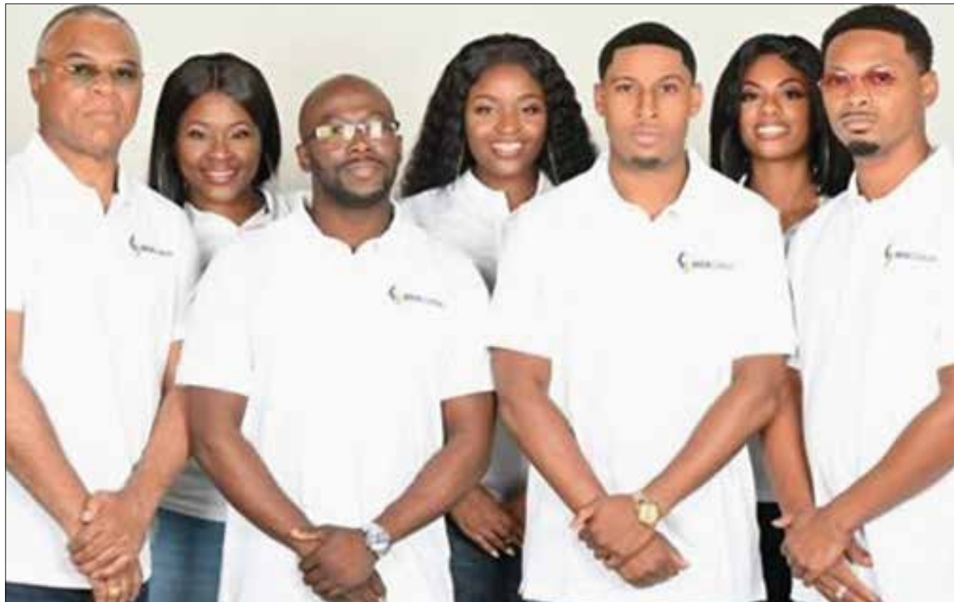
Representatives from BCA Culture, a cutting-edge technology company, have created an Internet app to help minority business owners eliminate the mystery and intimidation around the credit building process.

In September 2020, a cutting-edge, technology company out of Atlanta, BCA Culture, launched a new Internet app geared to African Americans and other minority business owners to eliminate the mystery and intimidation around the credit building process.