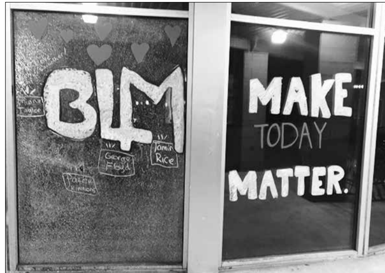
Windows were smashed at the nonprofit Blazers Boys and Girls Club next door to the North Police Precinct and several businesses along Northeast Martin Luther King Jr. Boulevard Monday night during a protest against the police in the heart of Portland's historic black community.

The Portland Police Bureau made two arrests for criminal mischief after declaring the assembly of about 80 people unlawful. Windows were broken at a U. S.