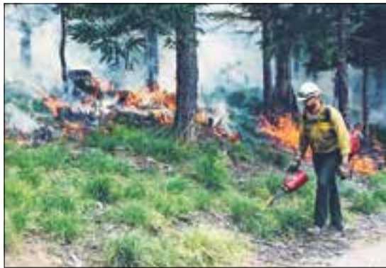
Clackamas Community College is participating in a government-sponsored program where students are paid to train as wildland firefighters.

A limited number of trainees can earn $16-$18.50 an hour while receiving their wildland firefighter and wildland fire chainsaw certifications. To qualify, participants must be at least 18 years old, be unemployed or underemployed, and have a valid driver's license. Members from the BIPOC (Black, indigenous and people of color) community are highly encouraged to apply.