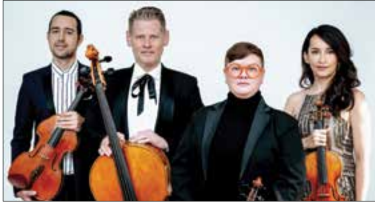
The Grammy-award winning Catalyst Quartet will present a concert in recognition of Black History Month featuring musical selections by three of the most talented Black composers of the 20th Century.

The Grammy-award winning musicians will perform the music of three of the most talented Black composers of the 20th Century, Coleridge-Taylor, Price, and Perkinson; along with selec-