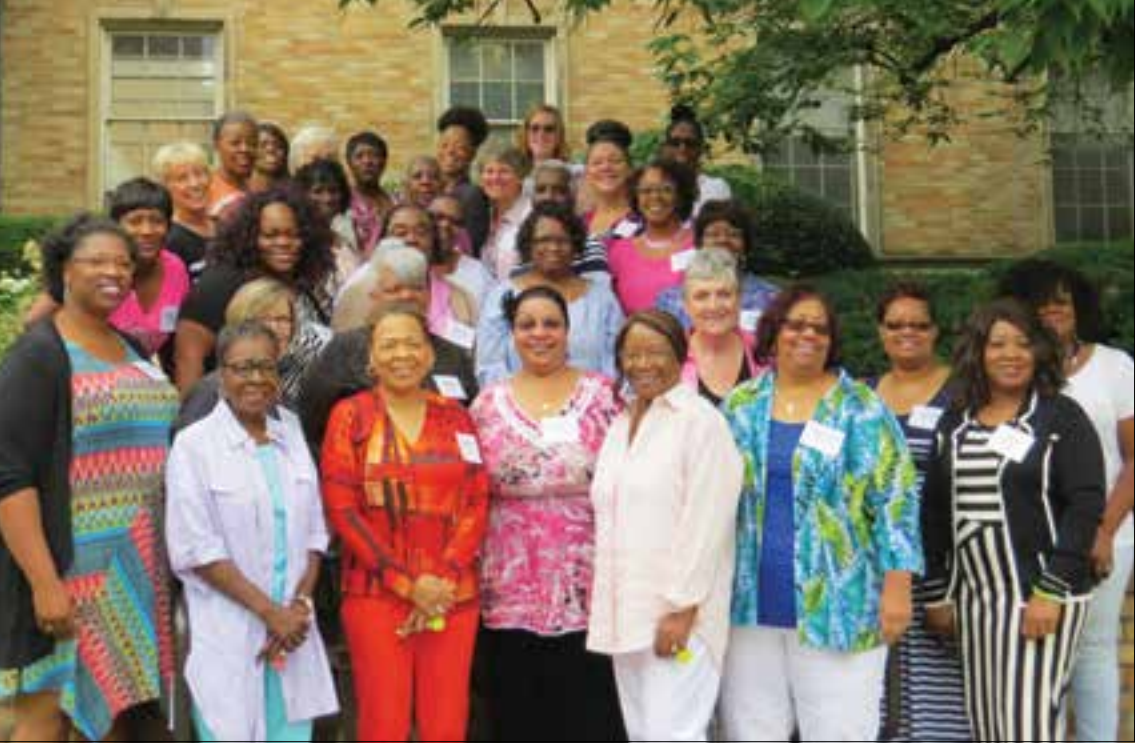
Worship in Pink volunteers working with Susan G. Komen Oregon and Southwest Washington on breast cancer prevention in Portland's African American community gather for a group photo during a training summit in 2017.